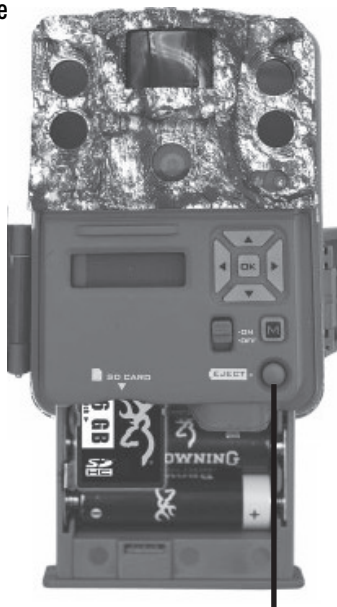
Battery Eject Button

Slide the battery tray into the closed position.