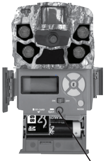
Battery Eject Button

Slide the battery tray into the closed position.