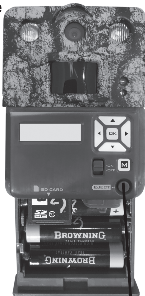
Battery Eject Button

Slide the battery tray into the closed position.