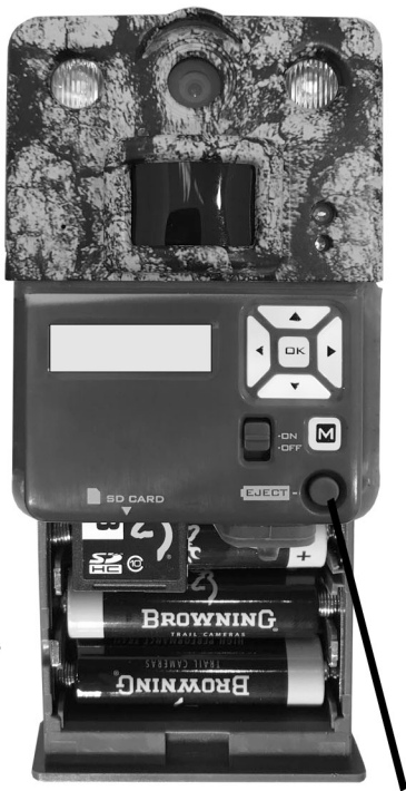
Battery Eject Button

Slide the battery tray into the closed position.