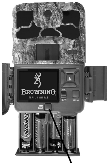
Battery Eject Button

Slide the battery tray into the closed position.