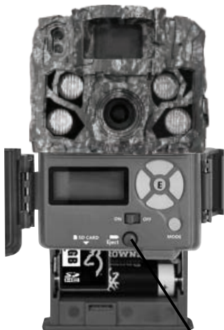
Battery Eject Button

Slide the battery tray into the closed position.