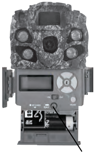
Battery Eject Button

Slide the battery tray into the closed position.