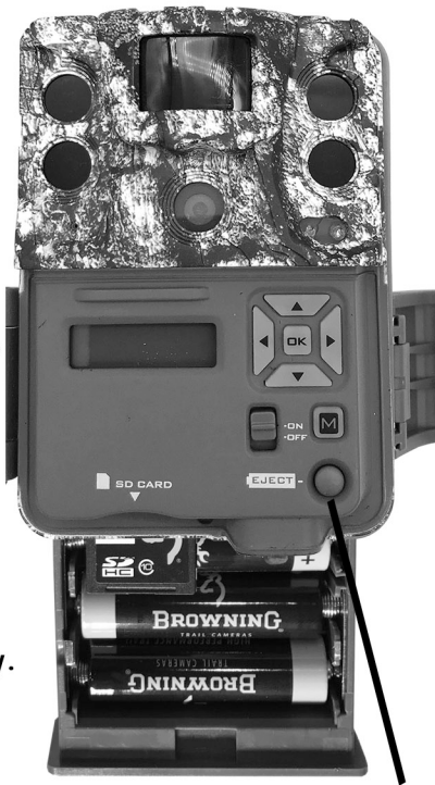
Battery Eject Button

Slide the battery tray into the closed position.