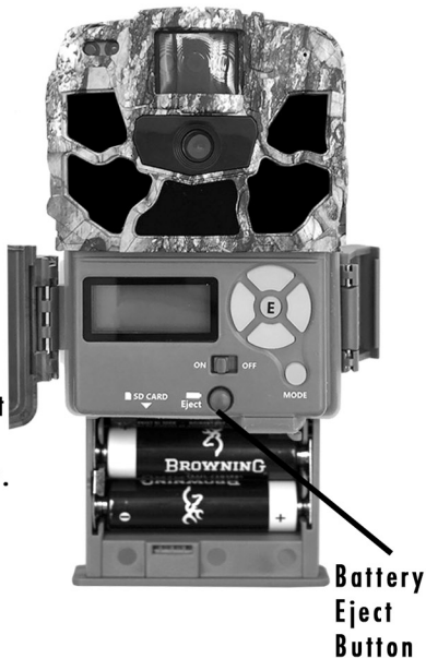
Battery Eject Button

Slide the battery tray into the closed position.