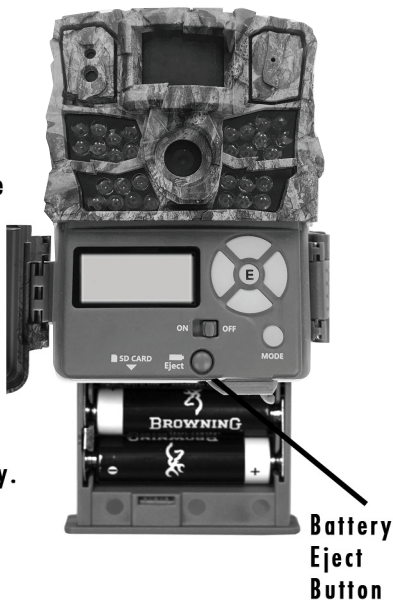
Battery Eject Button

Slide the battery tray into the closed position.